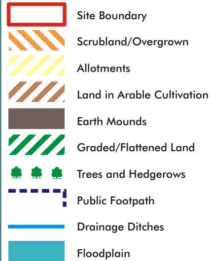
Figure 4 - Site Survey